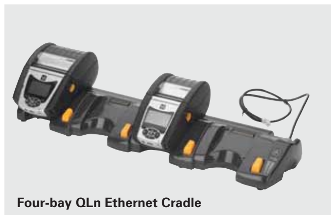
Four-bay QLn Ethernet Cradle