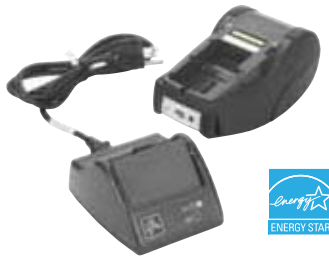
Shown with printer for reference purposes; printer is not included

The smart charger will fully charge a single standalone QLn smart battery in less than four hours. In addition to indicating battery charge status, it indicates battery health, allowing you to more accurately manage your spare battery pool. Specifically, LEDs show whether the battery is "good," has a "diminished capacity," is "past useful life," or is "unusable" and should be replaced. The smart charger comes with a charging base and power cable.