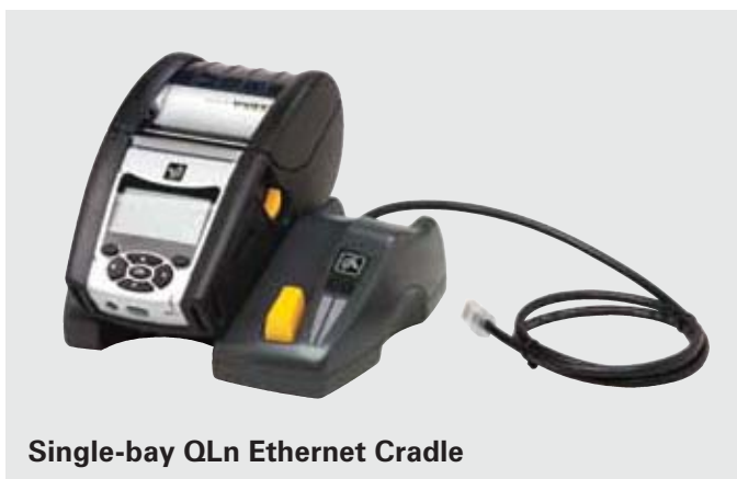
Single-bay QLn Ethernet Cradle