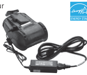
Shown with printer for reference purposes; printer is not included

Connect the AC adaptor to your QLn printer and mains socket to charge the printer's smart battery whilst in the printer. The printer can print labels and perform other functions during charging.